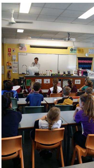
Students enjoying Science Primary Cluster Day