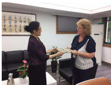
No.14 Middle School, Hangzhou