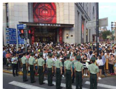
Nanjing Road Shanghai