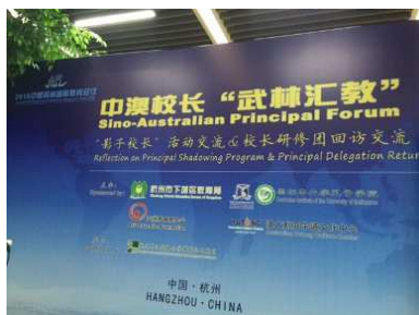
Principal's Forum Hangzhou